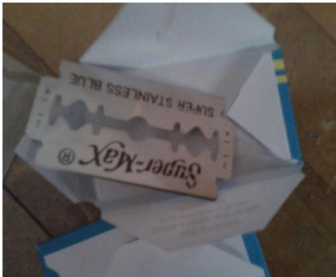
Razor to cut young girls' genitals

The research of WADI 17 , a non-governmental organization (NGO), on FGM in the Iraqi Kurdistan, led to the assumption that FGM is solely performed in that region. Gradually, it was revealed that the practice exists in the Iranian Kurdistan and some other regions such as Hormozgan, Ilam and Kermanshah. Research has not expanded to other regions such as Khuzestan, Sistan & Baluchistan, Khorasan, Turkeman Sahra and Semnan. Howe-